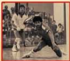
RUBEN THE LEGEND OF THE SPORT