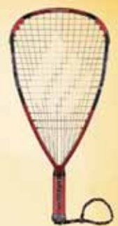
EKTELON RG TORON