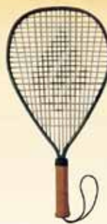
TORON THE MOST REVOLUTIONARY RACQUET OF ALL TIME. RUBEN'S RACQUET WHEN HE WAS #1 IN 88