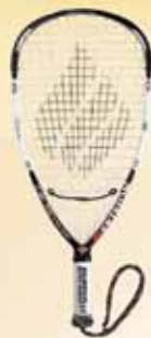
O³ RG RUBEN'S LATEST RACQUET